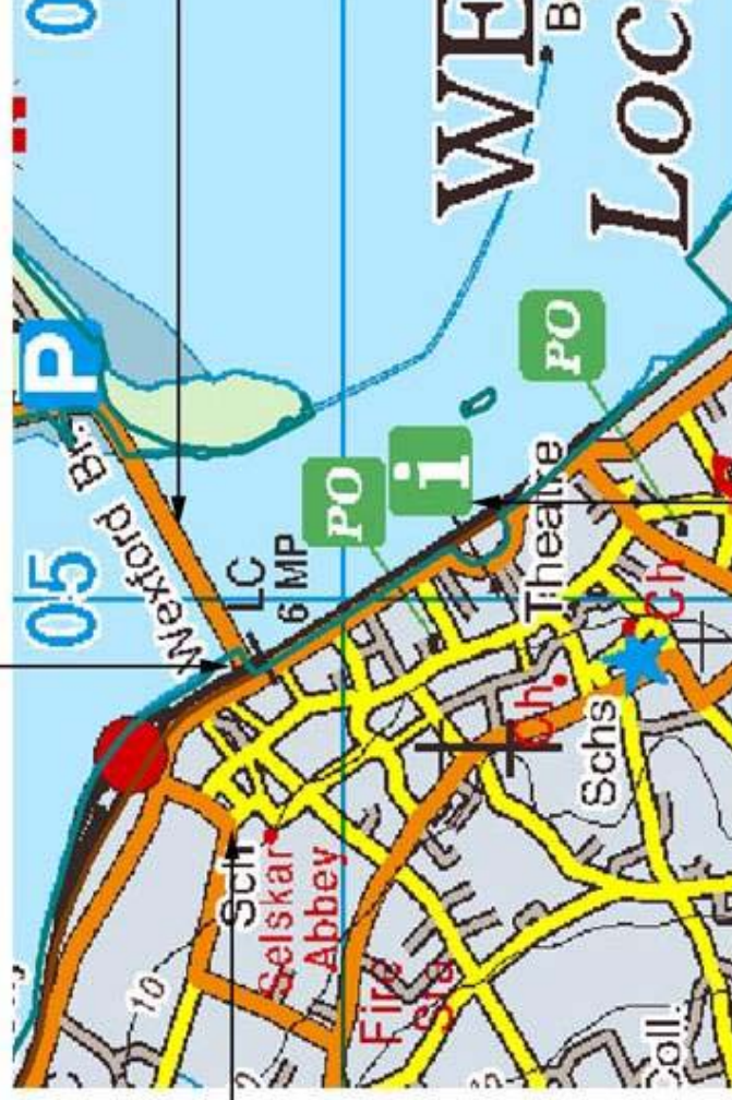
Location 1 junction of 1798 Street and Westgate.

North side of Wexford Bridge between O'Hanrahan station & Site of proposed RNLI building